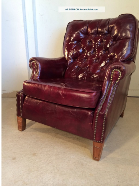
Sitting chair that is upstage right for jurors to pull back to direct focus elsewhere.