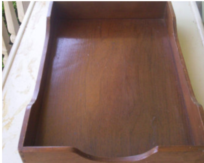
This is a folder tray with multiple copies of the court proceedings so that the jurors can get them and not lose track of them.