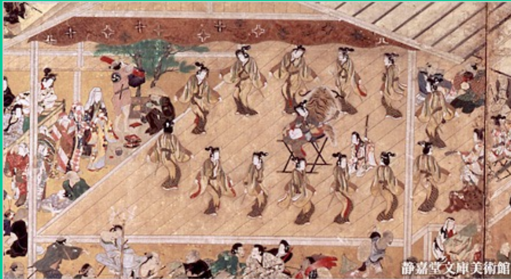
Onna-kabuki with courtesans on stage ("Shijo kawara yuraku zu byobu" Seikado Bunko Art Museum collection)

Onna Kabuki : early form of Kabuki, mainly women on stage